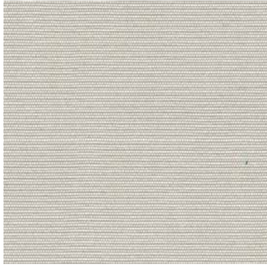
R-117 CRUDO / RAW