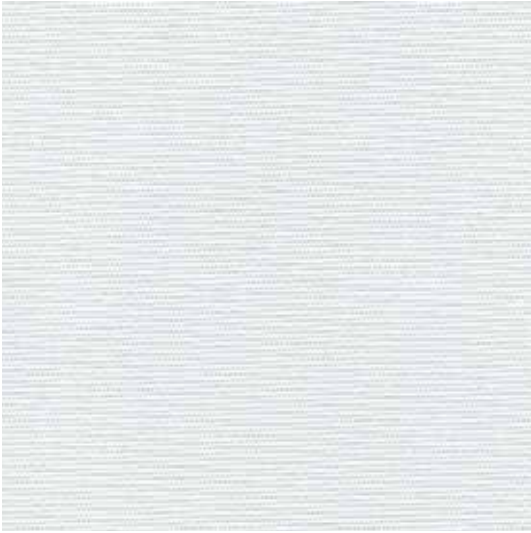
R-099 BLANCO / WHITE